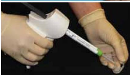
Figure 6 and 6a

Subsequently, the Aqua Splint is inserted in the lower jaw (saddle on 35/36 or 45/46). A reverse "V" marks the middle of the connecting water tube and facilitates accurate positioning between 31, 41. Strong contact between the tube and the gingiva should be avoided. (Fig. 7)