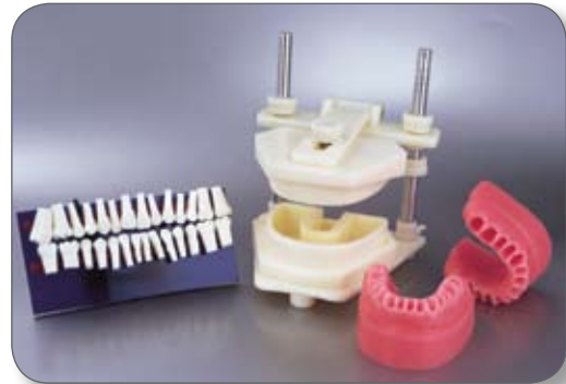
Articulator (PN 631-030) Epoxy Teeth (PN 631-032) Ideal Occlusion Wax Form (PN 631-035)

For more information on our products, orthodontic laboratory services and educational offerings, please contact us: