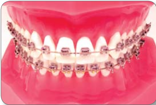
Nanda Prescription Opti-MIM Brackets 7x7 (PN 631-018RN)

Call today for more information on any of our patient education products, and ask about a free poster! Contact us at 888.851.0533 , or email us at USASales@OrthoOrganizers.com . Or, for more information please visit our Web site at OrthoOrganizers.com .