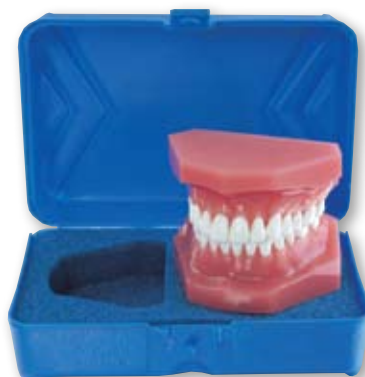
Pink Epoxy Typodont with Case (PN 621-001)