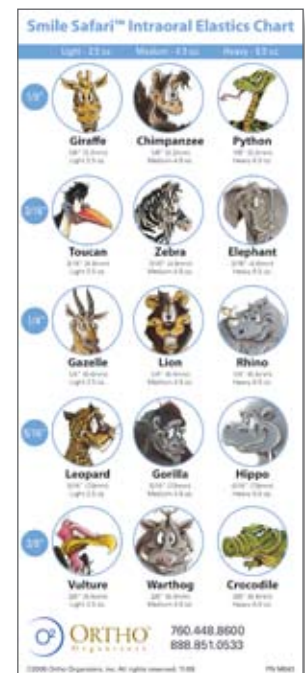
Smile Safari Elastics Chart